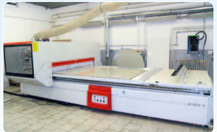
CNC machine tool