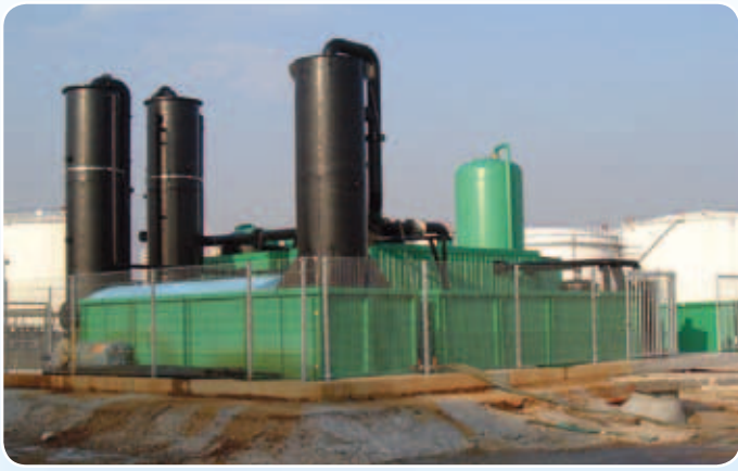
Process unit for underground water decontamination