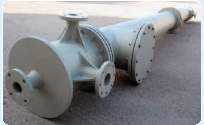
Plastic flanges - detailed view