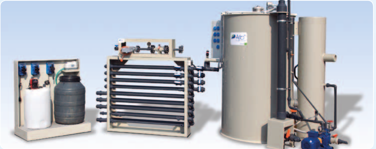
AS-FLOT - Mobile Flotation Unit