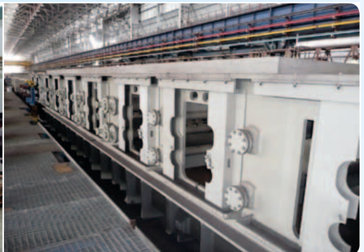
Polypropylene pickling line for a plating plant